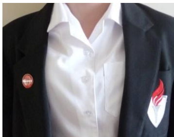
Revere collar no tie